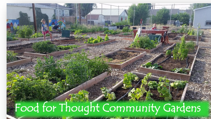
Food for Thought Community Gardens