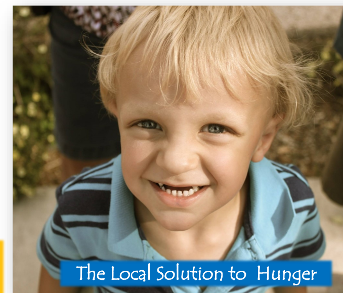
The Local Solution to Hunger