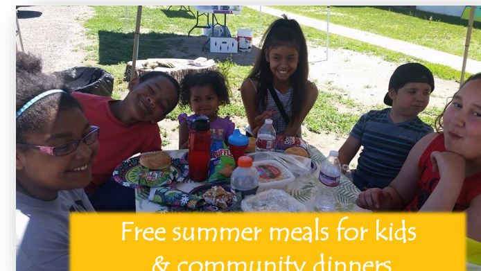
Free summer meals for kids & community dinners

Working to create a local solution to childhood hunger through a system of equitable food access.